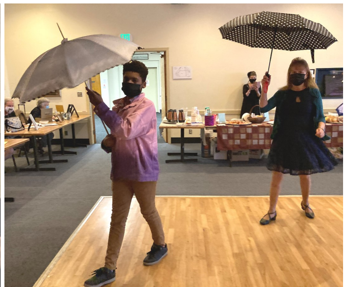
No, it's not a rain dance, just a couple of jazz fans enjoying a New Orleans-style second-line jaunt.