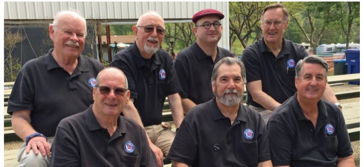
Grand Dominion Jazz Band