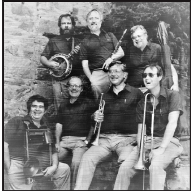
Above: Grand Dominion Jazz Band - 1990

We are lucky to have such a great band in our neighborhood, and since it is well past time for the band to make a return trip to our Sun-